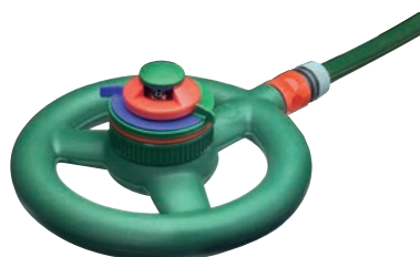
GS1 Gear Drive Sprinkler